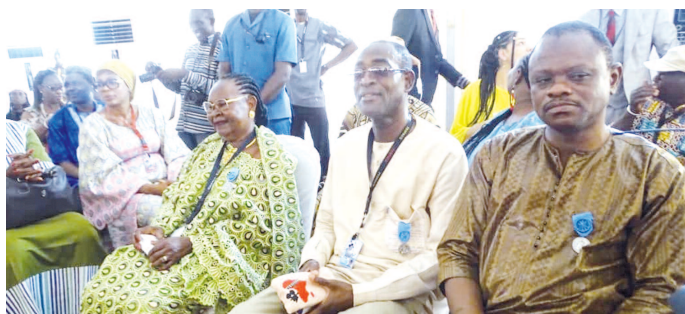
Recipients at the decoration ceremony