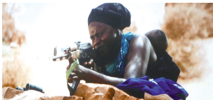
Sira, the heroine of the film

Each edition of FESPACO is an opportunity to distinguish men and women of the movie industry. Tradition has been fulfilled at this 28th edition. During a ceremony hosted on Thursday 2nd March 2023 in the premises of the Burkinabe Shippers' Council (CBC), about fifteen men and women have seen their merit recognized by the Minister of Communication, Culture, Arts and Tourism. They received their medals of the Order of Merit in Communication, Culture, Arts and Tourism. Winners of the day expressed their deep appreciation for this distinction which comes as a tribute to their hard work and commitment.